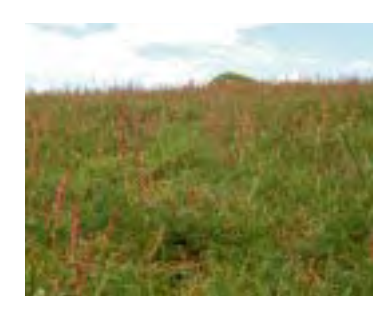
Step 3 – Prepare the ground for sowing seed in the autumn or early spring by grazing hard in the lead up to create patches of bare ground (not poached), or scarify the surface of the ground to create these bare patches or over seed. Seed can be spread directly by hand or by machine or by the spreading of green hay from a donor wildflower site. If green hay is used it must be spread on the recipient land within two hours of being cut on donor land.

Step 4 – Light grazing by livestock after sowing can help to work the seed into the soil. If a whole field has been newly sown it should be grazed lightly by sheep or topped regularly in the first year. Horses should be able to start grazing between 12-18 months after sowing.