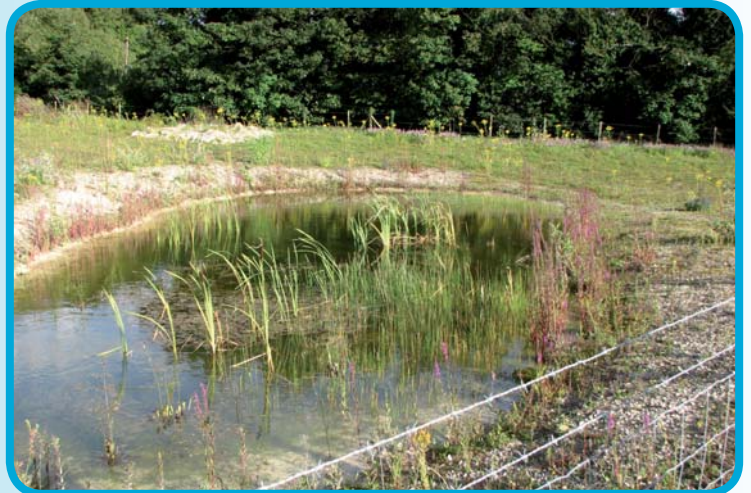
A newly dug pond left to colonise naturally

Any area of standing freshwater between 1m 2 and 2 hectares in size that holds water for at least 4 months of the year