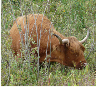
Highland Cattle (above), Konik Ponies (below) and goats are grazing and browsing the Trust's Blean Reserves.