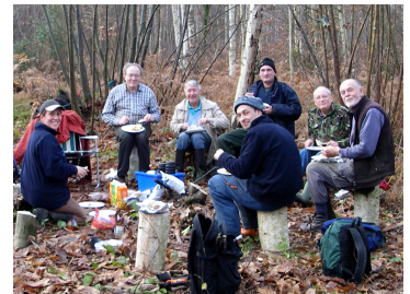
Blean volunteers in East Blean Wood, Christmas 2009

nightingales singing in the woods, in the day as well as at night. The nightingale is a secretive bird, preferring to stay well hidden in dense coppice regrowth, making it more likely to hear its song than to spot the bird.